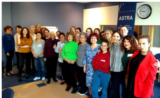
ASTRA Network annual conference; Central and Eastern European Women's Network for Sexual and Reproductive Health and Rights.

10 years anniversary of the Eastern Partnership by Forum Syd in Sweden.