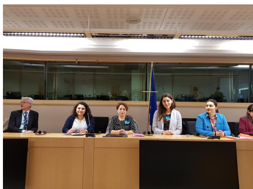
Meeting with MEPs at European Parliament. Covered recent escalation of trans woman speech at Armenian Parliament