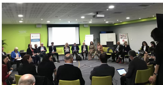
11th Annual Assembly of the Eastern Partnership Civil Society Forum: Joining Forces for a Win-Win Partnership"