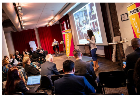
Eastern Partnership Civil Society Forum Working Group 1 "Democracy, Human Rights, Good Governance and Stability" meeting

The event focuses on media freedom, good governance and gender equality in the region and how the cooperation and situation for the civil society can be improved after 2020.